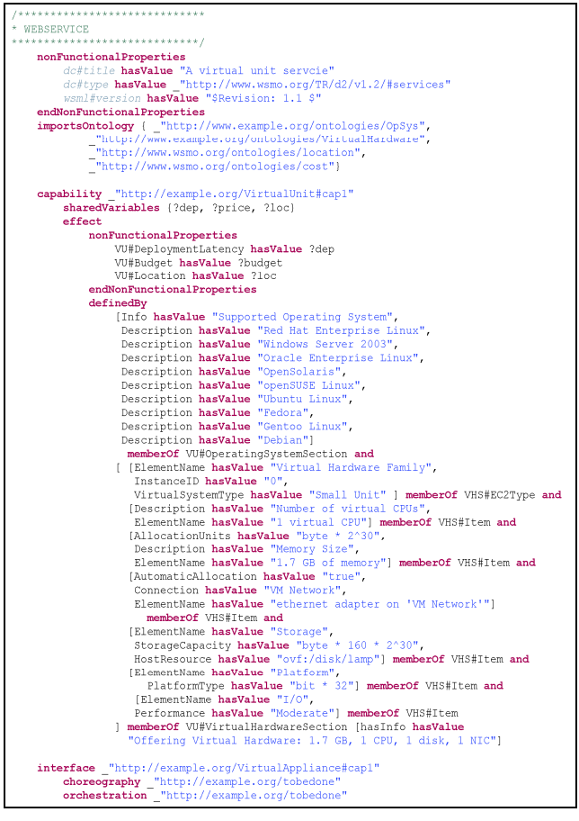
Figure 3. Virtual units Ontology

these elements have to be interrelated somehow; precisely speaking, we expect that some relationship between G and W has to be exist. The service matching in the proposed architecture is based on Description Logics (DLs) [38] which are a family of knowledge representation formalisms that are able to represent the structural knowledge of an application domain through a knowledge base including a terminology and a world description. The basic formalism of a DL system comprises three components: 1) Constructors which represent concept and rule, 2) Knowledge base (KB) which consists of the TBox(terminology) and the ABox(world description). The TBox presents the vocabulary of an application domain, while the ABox includes assertions about named individuals in terms of this vocabulary, 3) Inferences which are reasoning mechanisms of Tbox and Abox.